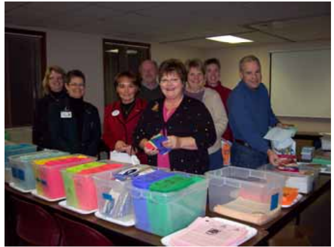
Safe Kids Stars: Some of the Grand Forks Sunriser Kiwanis